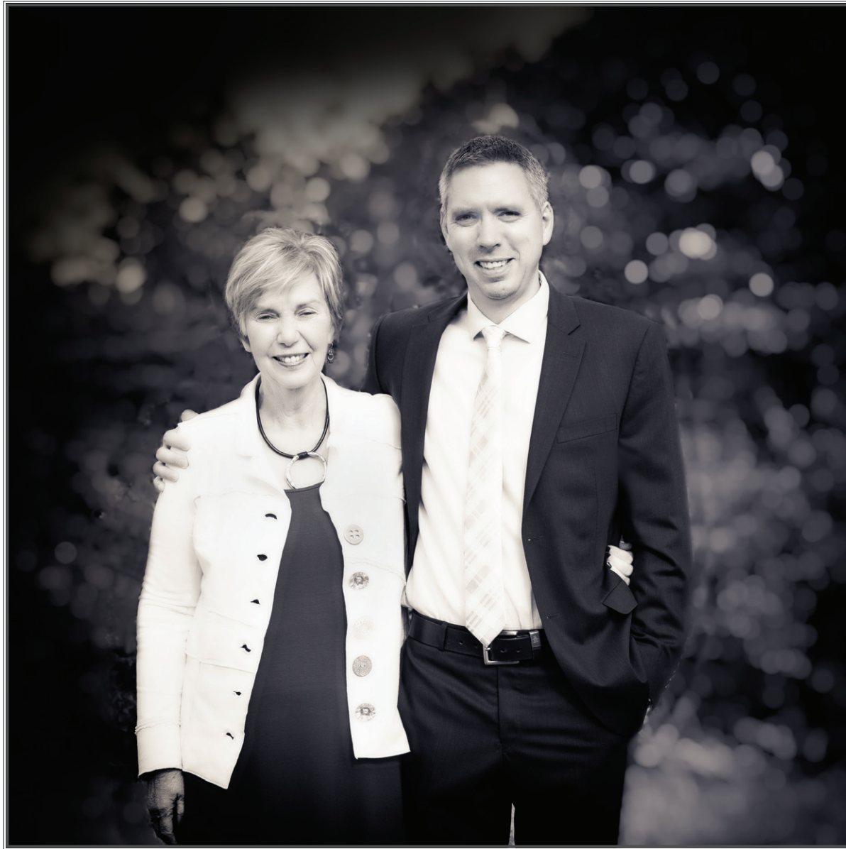
My lovely Son