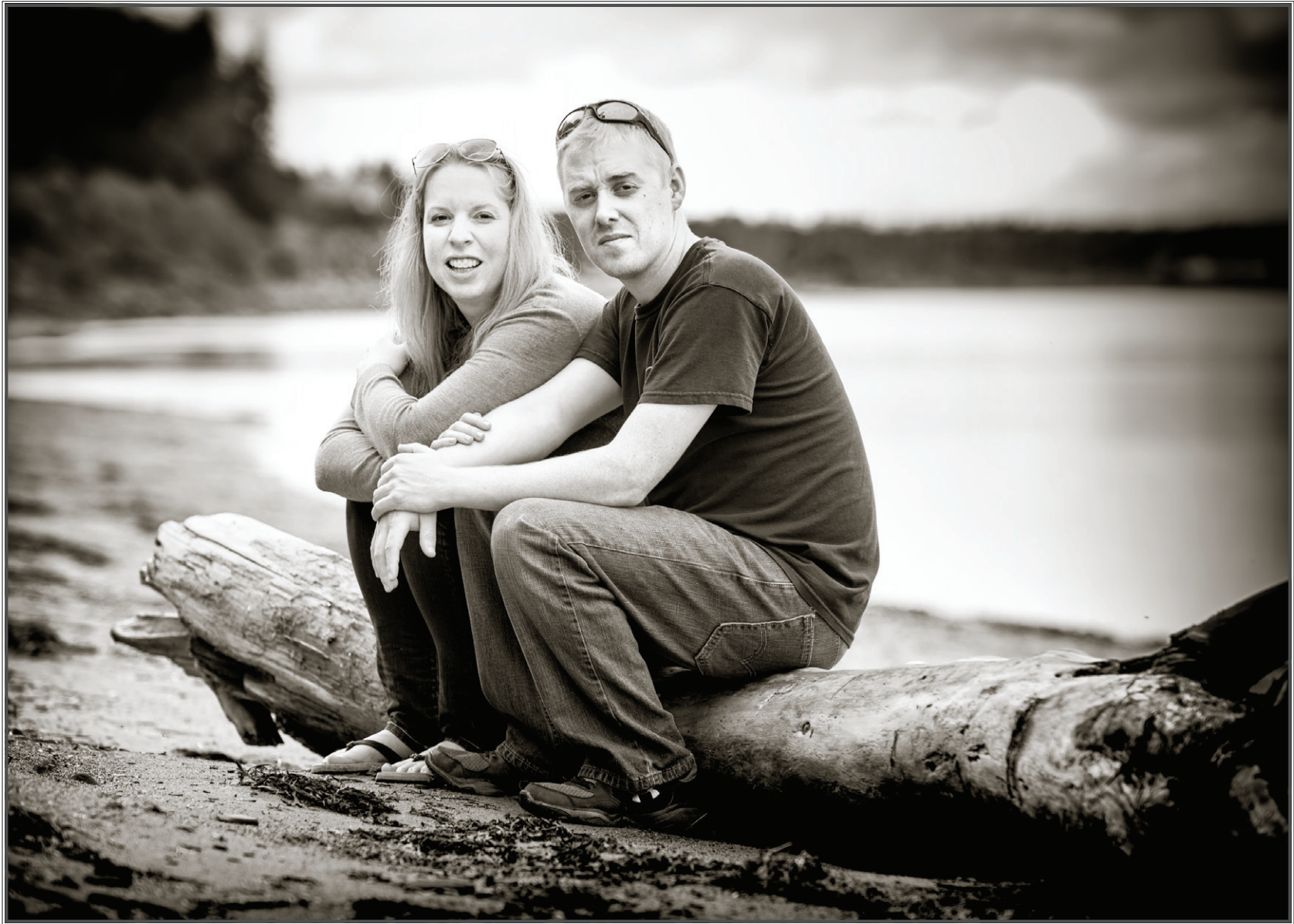
On the Beach