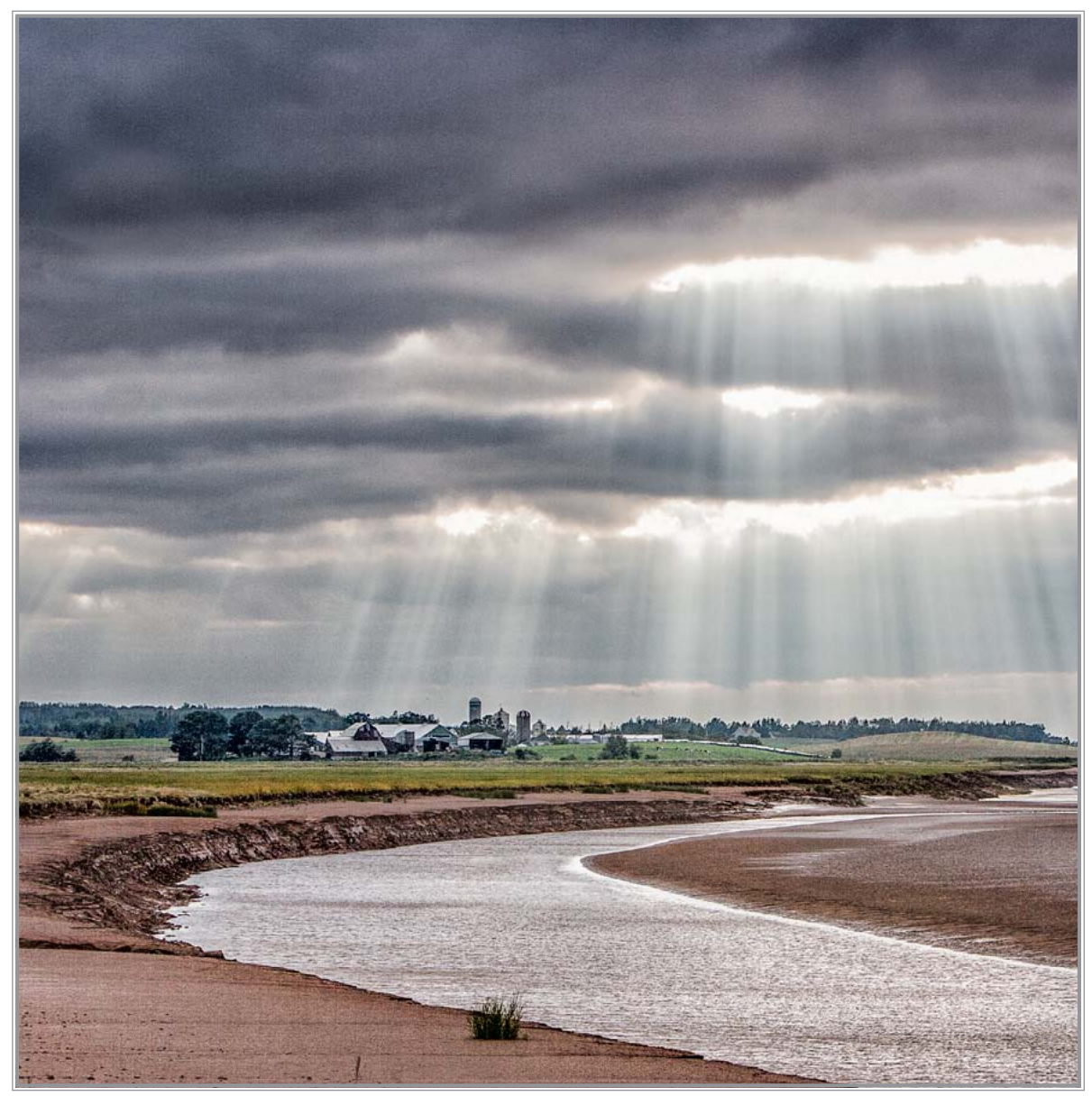
Old Barnes, Truro

devoid of people. Cities are surrounded by vast forests and houses that seem to stand alone in the middle of a very natural landscape without roads or any other signs of habitation. Checking the population data I note that when Bruegel was painting the world there were only a total of 500 million people living in it. Turner and Constable lived at a time when the population was around 790 million and by the time Monet captured our world there were still only over 1 billion. Today in 2012, 86 years after Monet died there are over 7 billion of us and still counting. I wonder what kind of a world these artists would paint if they were alive today?