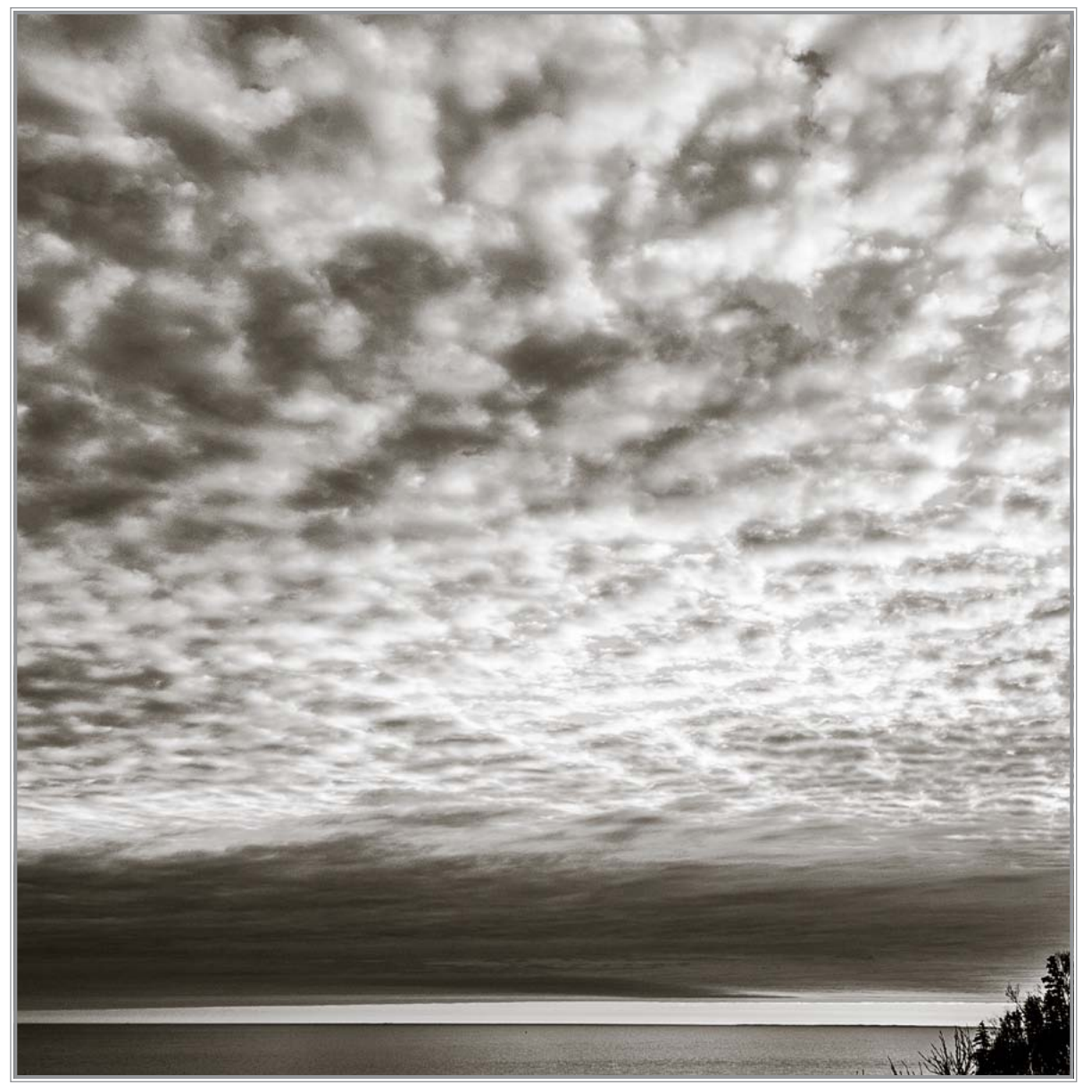
Looking north from my home

with chestnuts and mulled wine and cosy evenings by the fire. Today it means taking up the garden and clearing out all the dead plants. Raking leaves and cleaning gutters. Putting the snow tyres on the car and the snow blower on the tractor. Stacking wood and cleaning the chimney in case it catches fire. Also of course making ham and wine and jams and whisky marmalade and Christmas pudding and fruit cake and generally getting the nest ready for the seasons of storms. The darning of socks and knitting of pyjamas and other things that enable one to stay indoors with the cat and dog by the fire.